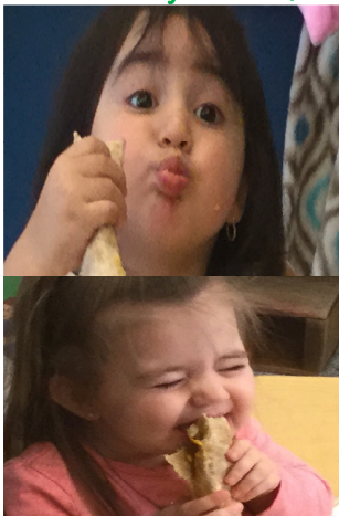
Taco Tuesday RM. 104