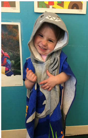
Wacky Wednesday RM. 103