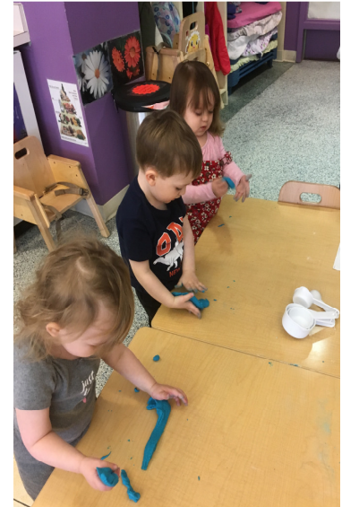
Room 103 having fun with the Play Dough they made